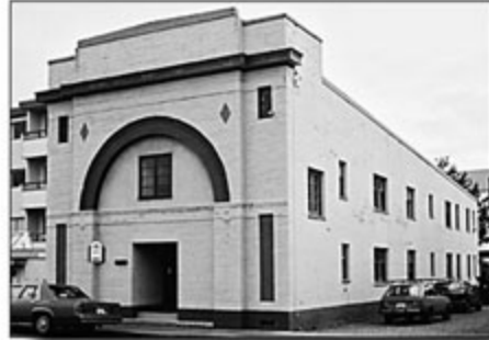
Avenue Theatre Building (c 2005)

Do you have any photos of the Avenue Theatre? If yes, please specify in the form below